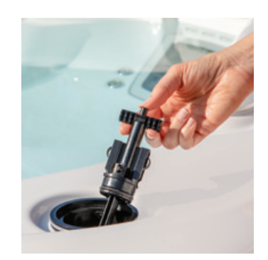
The maintenance-free cartridge can be replaced in seconds, without tools.

The FreshWater Salt System will change the way you use your hot tub by taking the worry out of water care. With water that's always hot and ready to use, you'll spend less time maintaining your spa and more time using it.