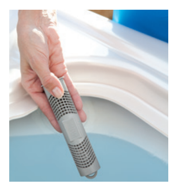
For the ultimate water care solution, add a FreshWater Ag+° silver ion cartridge to further reduce the need for chemical sanitizer.**

*Many factors affect the life of spa water, such as bather load and water chemistry. When spa water is properly maintained considering these factors, a 3-pack of cartridges will keep water clean and clear for up to a full year. **Available in the U.S. only.