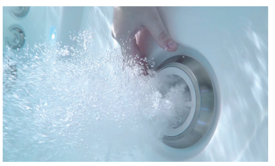
Comfort Control lets you control the jet flow on and off to customize your experience.

You have different needs on different days. Only Hot Spring spas have the Comfort Control<sup>®</sup> system, which allows you to dial in the ideal amount of air and water for powerful hydromassage or just a soft touch—simply turn the jet face or adjust the air control lever on the bar top. An easy-to-reach