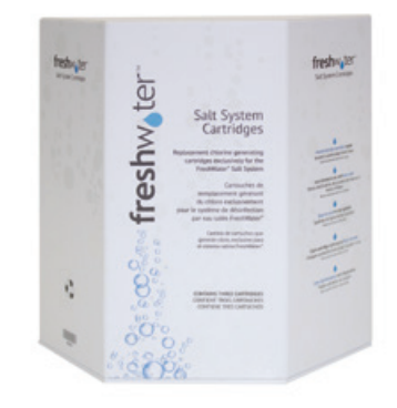
One 3-pack of cartridges provides a year's worth of water care.*